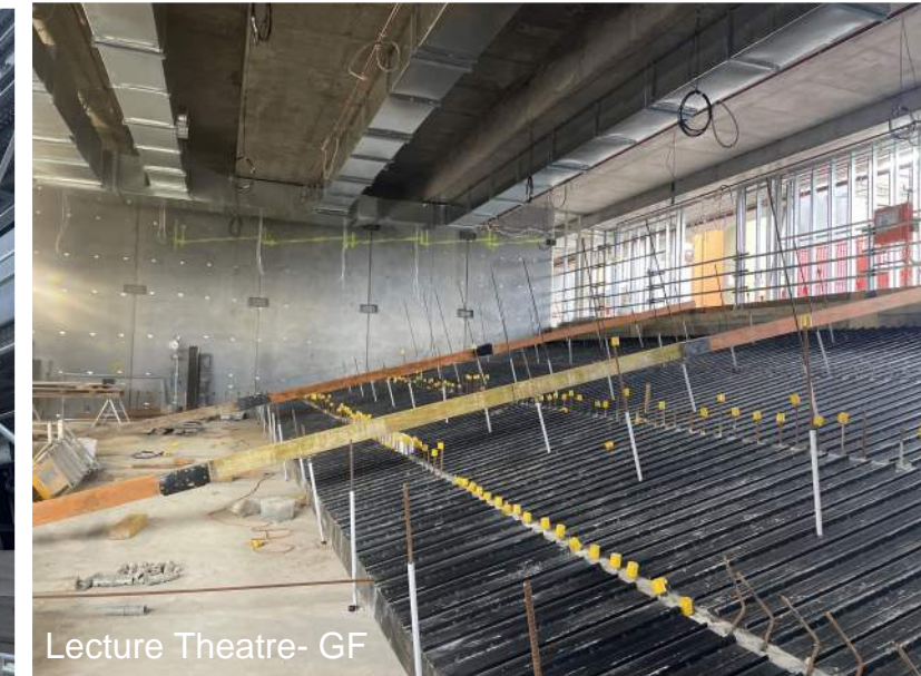
Lecture Theatre- GF